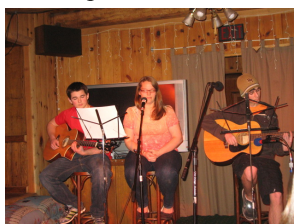
Coffeehouse & Bible Study

The Valley Youth Network is a network of concerned people and organizations who seek to reach out to area high school students with the Gospel of Jesus Christ.